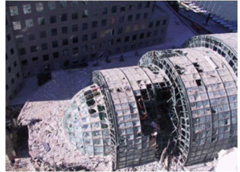
New York: September 11th

This is part of the list of killings in the name of Islam maintained by TheReligionofPeace.com . Most of these incidents are terror attacks. A handful are honor killings or Sharia executions.