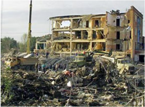
Hospital at Mozdok, Russia

This is part of the list of killings in the name of Islam maintained by TheReligionofPeace.com . Most of these incidents are terror attacks. A handful are honor killings or Sharia executions.