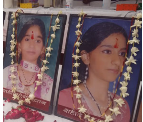
Jaipur, May 13

During this time period, there were 2207 Islamic attacks in 42 countries, in which 10716 people were killed and 17804 injured.