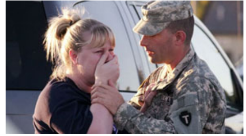
Fort Hood, Texas

This is part of the list of killings in the name of Islam maintained by TheReligionofPeace.com . Most of these incidents are terror attacks. A handful are honor killings or Sharia executions.