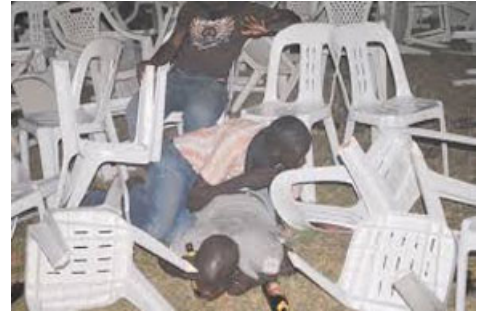
Uganda: FIFA World Cup Bombing

This is part of the list of killings in the name of Islam maintained by TheReligionofPeace.com . Most of these incidents are terror attacks. A handful are honor killings or Sharia executions.