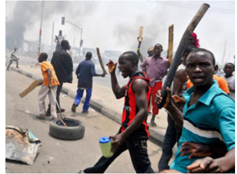
Kaduna Riot: 800 Dead

This is part of the list of killings in the name of Islam maintained by TheReligionofPeace.com . Most of these incidents are terror attacks. A handful are honor killings or Sharia executions.