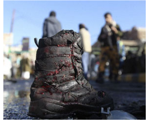
Yemen, May 21

During this time period, there were 2486 Islamic attacks in 58 countries, in which 11559 people were killed and 20273 injured.