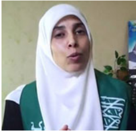
What can we learn about Islam from this woman?