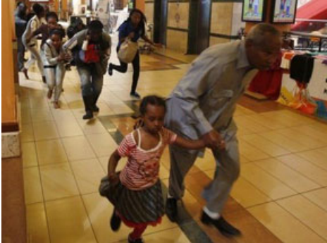
Westgate Shopping Mall

List of Killings in the Name of Islam: 2013 This is part of the list of killings in the name of Islam maintained by TheReligionofPeace.com . Most of these incidents are terror attacks. A handful are honor killings or Sharia executions.