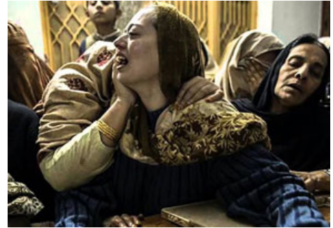
Peshawar School Massacre

This is part of the list of killings in the name of Islam maintained by TheReligionofPeace.com . Most of these incidents are terror attacks. A handful are honor killings or Sharia executions.